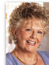
Dr. Florence Littauer President, Class Speakers, Inc. Professional Speaker & Author